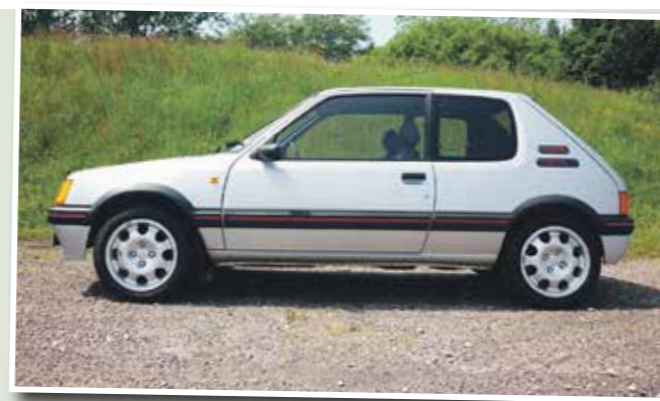
Last month, Silverstone Auctions' 1989 Peugeot 205 GTI 1.9 sold for a record breaking £30,983 including premium. Are hot hatch values set to skyrocket?

Find RAC Fuel Watch's online crude oil chart at: www.rac.co.uk/drive/advice/rac-fuel-watch/historical-oil-price-data